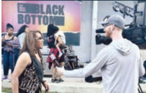
Women Who Drum