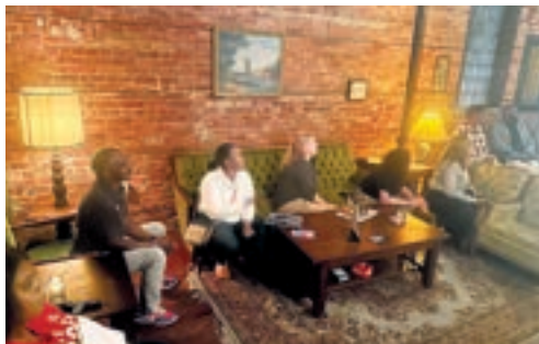
Main Street Mixer