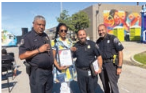
National Night Out