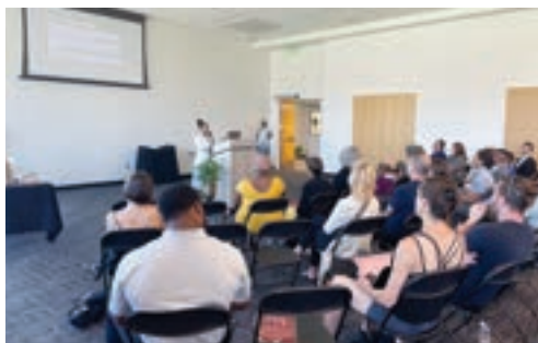
NEMJ/BDA Launch Event

“Our programs and partnerships have offered business services that truly help fill gaps for business such as access to capital and understanding and assistance with some of the complexities as an entrepreneur.”